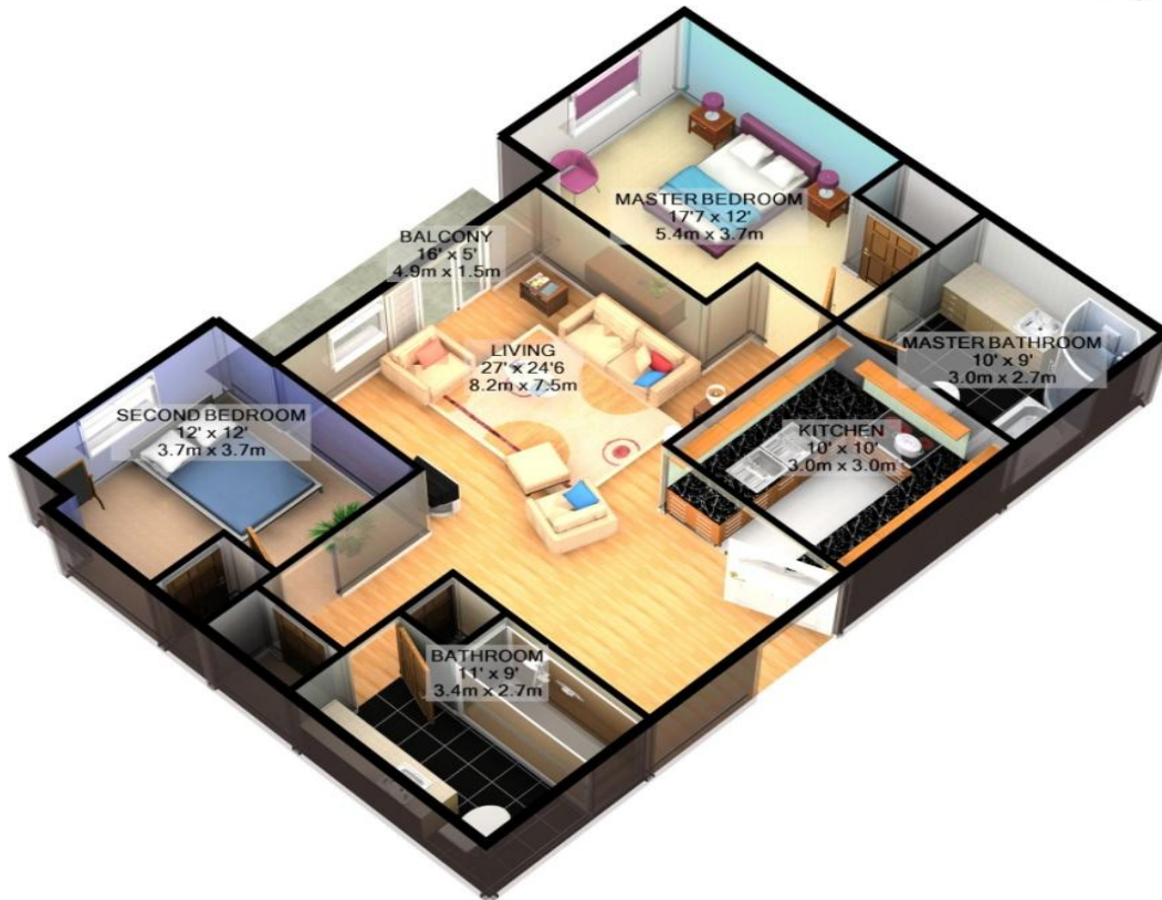
CORAL WAY TOTAL APPROX. FLOOR AREA 95.5 SQ.M. (1028 SQ.FT.)

For illustrative purposes only. Decorative finishes, fixtures, fittings and furnishings do not represent the current state of the property. Measurements are approximate. Not to scale